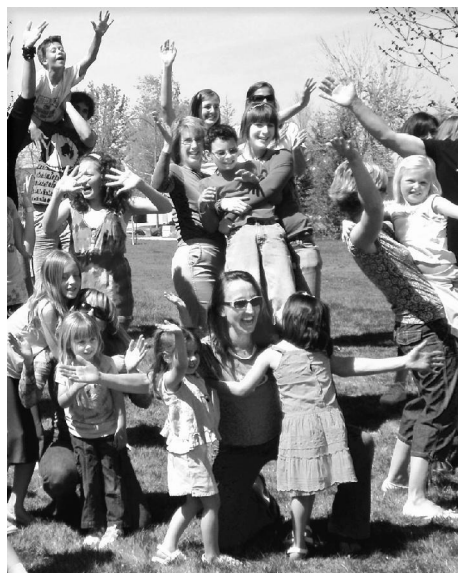
"Hug Your Kids Today"